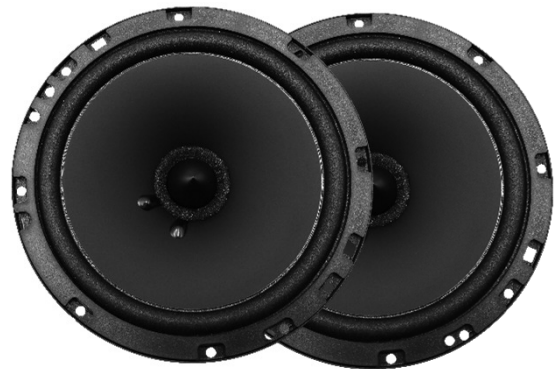
2-way component system with external tweeter