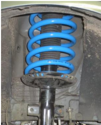
Reinforced Front Springs