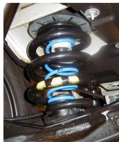
Auxiliary springs HV-198075