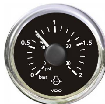
Picture: Mechanical Water Pressure Gauge